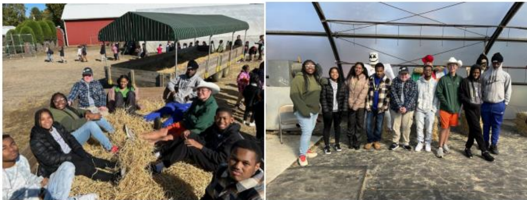
WDHS CBI students experience Life on the Farm at Duffield's Farm.